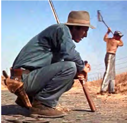
He squats down because he's tired from standing so long.