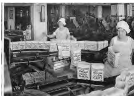
Do you see the boxes of Kellogg's corn flakes they're making? The article says that Dr. Kellogg invented both corn flakes, and peanut butter.