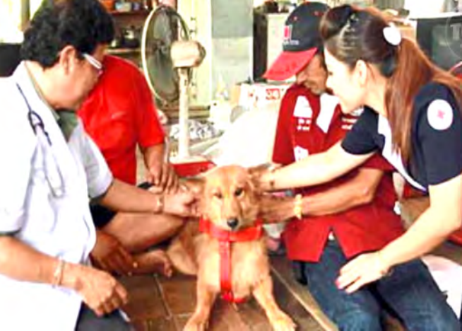
And here's the humble hero whom the holy angels used to save the precious little one. Dear Jesus saved the baby. Dear Jesus is saving you!