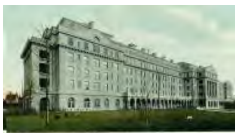
The Battle Creek Sanitarium before it burned in 1902.