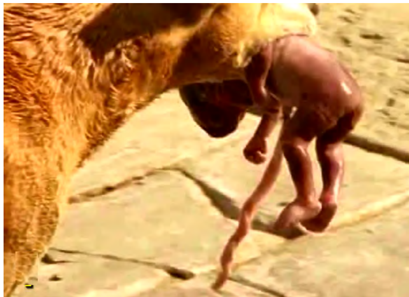
Charity: The December letter revealed that some poor liberals are pleading with people that because of climate change we must eat dead people and eat babies! Is that why the dog picked up this living baby with its umbilical cord beside a dumpster? Is this the kind of thing that happens in the end of the world while the devil is tricking the poor fiends into legalizing marijuana, and people are swallowing hot sauce from hell?

shall be sure. Thine eyes shall see the king in his beauty: they shall behold the land that is very far off.”