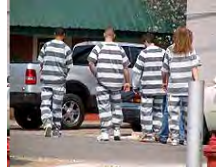
A chain gang in the U.S. in 2006.