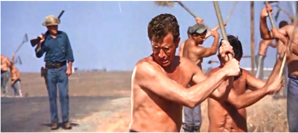
Their ankles are bound to each other with chains.

shutteth his eyes from seeing evil; He shall dwell on high: his place of defense shall be the munitions of rocks: bread shall be given him; his waters shall be sure. Thine eyes shall see the king in his beauty: they shall behold the land that is very far off.”