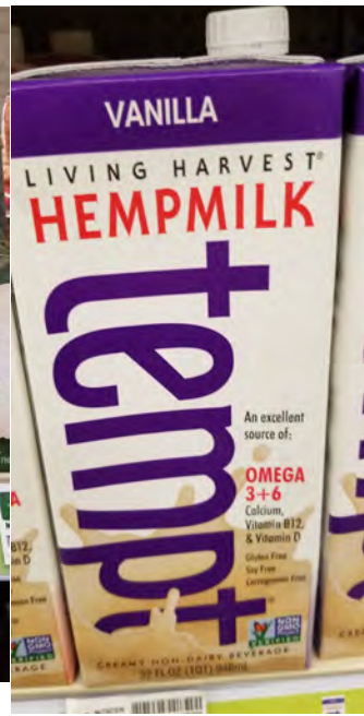
Hemp milk. Can you guess why the word Tempt is in giant letters?