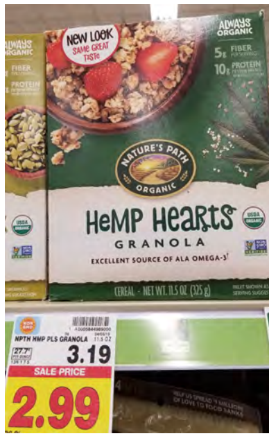
Yummy Hemp granola. Can you guess why a Marijuana leaf is printed on the box?

6) The magazine says, "Once considered the scourge of society, Cannabis is now seen as a medical miracle." While the fiends are fooling the masses, the poisonous drug is more of a scourge now than ever! Big businesses are rushing to invest billions in it. It's predicted that Marijuana/Hemp will surpass soy beans. Instead of God's people drinking soy milk, the fiends would be happy to soak their brains in Marijuana/Hemp milk. It will continue to grow and continue to open wide its doors into hell until the degraded masses, straining with various degrees of goony eyes, will look at God's dear people and sentence them to death. "And he had power to give life unto the image of the beast, that the image of the beast should both speak, and cause that as many as would not worship the image of the beast should be killed." Rev. 13:15.