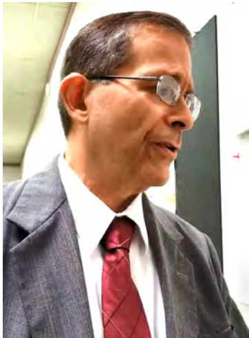
Retired police officer.

7) Drug pushers would joyfully agree with the magazine that Marijuana/Hemp is helpful for relieving things like Alzheimer's, anorexia, back pain, depression, diabetes, epilepsy, insomnia, kidney disease, multiple sclerosis, obesity, Parkinson's disease, psoriasis, rheumatoid arthritis, stroke, vascular disease, wasting syndrome, yeast infection, zoster, and may be "good for what ails ya."