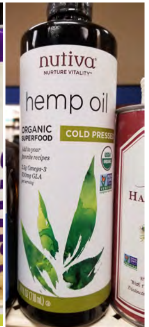
Soothing Hemp oil. Will anyone notice the Marijuana leaves on the label? The devil is counting on people's brains getting more and more dull until they joyfully cross over the line.

When the ambulance got the poor church members to the hospital - they found from their blood - that they were filled with THC - - from Hemp brownies! They were all told that Marijuana was in their blood! The dear elderly church ladies never dreamed that they would ever know how it feels to be a dope fiend! But dear Jesus didn't hold it against them because they had no way to know what was in the tempting tidbits. From now on, it may be that the quote - "It is better to let sweet things alone" will be ringing in our ears as "the end of all things" is getting closer and closer.