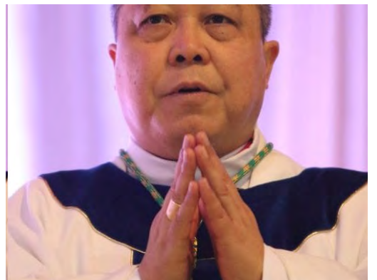
Archbishop Auza, Vatican representative at the United Nations since 2014.