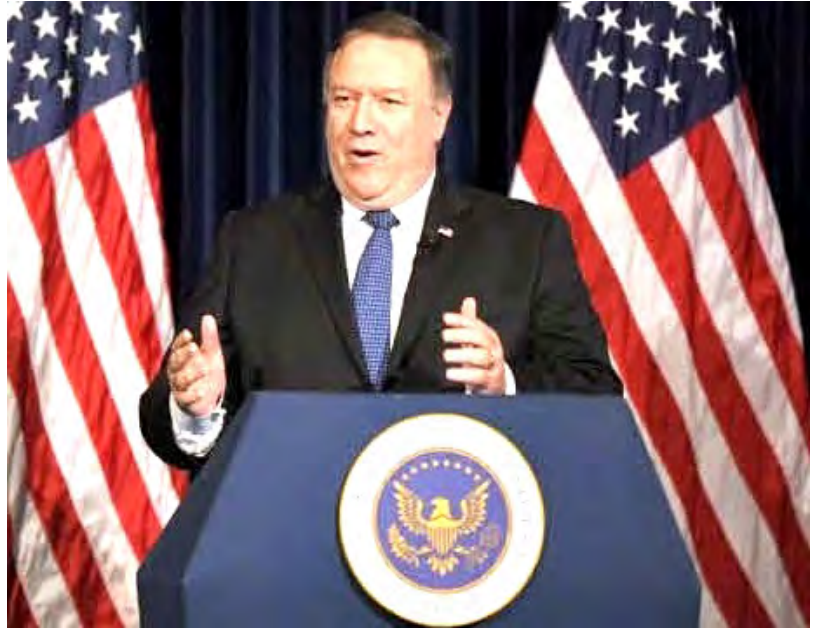
U.S. Secretary of State, Mike Pompeo, says Catholic Church has "central role" in fight for religious freedom. Cruz News . Notice the word, "fight." After the start of the "Ministerial to Advance RELIGIOUS FREEDOM," Cruz headlines read, "United States to co-host Vatican summit on religious freedom." Before the devil's Sunday law is passed, why would the Protestant U.S. and the Catholic Vatican work hand in hand?

“And then shall that Wicked be revealed, whom the Lord shall consume with the spirit of his mouth, and shall destroy with the brightness of his coming: