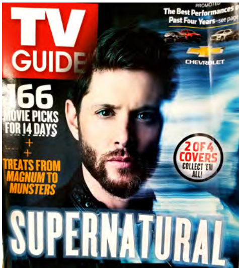
"Sweeping all into the ranks of Spiritualism."