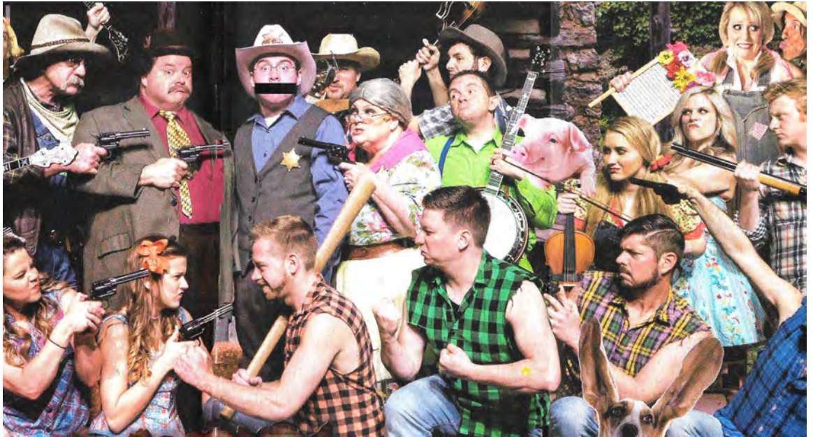
What will church members be like in the end of the world?

because thou hast heard, O my soul, the sound of the trumpet, the alarm of war... For my people is foolish, they have not known me... they are wise to do evil, but to do good they have no knowledge. I beheld the earth, and, lo, it was without form, and void; and the heavens, and they had no light. I beheld the mountains, and, lo, they trembled, and all the hills moved lightly. I beheld, and, lo, there was no man, and all the birds of the heavens were fled. I beheld, and, lo, the fruitful place was a wilderness, and all the cities thereof were broken down at the presence of the LORD, and by his fierce anger. For the whole land shall be desolate; yet will I not make a full end.”