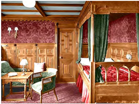
First class bedroom.

"In an age that worshiped wealth, the 325 first class passengers were an awesome assembly. Titanic sailed from South Hampton at noon. She was expected to reach New York in just seven days with 2,228 people aboard. One commentator said, "For the ladies in the upper deck, fashion and gossip was the main sport." Have you ever heard any church members talking about fashion and gossip?