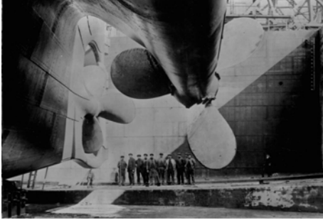
Here’s one of the three giant propellers towering over 9 men.

“When God’s presence was finally withdrawn from the Jewish nation, priests and people knew it not. Though under the control of Satan, and swayed by the most horrible and malignant passions, they still regarded themselves as the chosen of God... So, when the irrevocable decision of the sanctuary has been pronounced and the destiny of the world has been forever fixed, the inhabitants of the earth will know it not. The forms of religion will be continued by a people from whom the Spirit of God has been finally withdrawn; and the satanic zeal with which the prince of evil will inspire them for the accomplishment of his malignant designs, will bear the semblance of zeal for God. [They’ll have a “celebration church” which foolish virgins and papal infiltrators have been celebrating in now for quite a while. The devil is now practicing for this event as his agents sing and swing and sin and celebrate.]