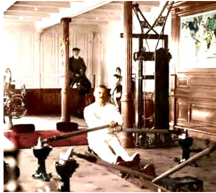
The Titanic’s gym. He doesn’t know that in working out on the rowing machine he might be practicing to have a part in the picture below.