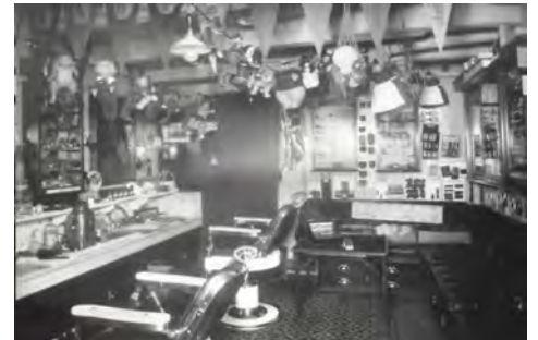
Here's one of the two barber shops on board. Hanging from the ceiling and walls are trinkets that they have for sale.