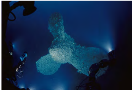
And here it is now.

repentance of their many sins, and pleading the Saviour’s promise: ‘Let him take hold of My strength, that he may make peace with Me; and he shall make peace with Me.’ Isa. 27:5. Their faith does not fail because their prayers are not immediately answered. They lay hold of the strength of God as Jacob laid hold of the Angel; and the language of their souls is: ‘I will not let Thee go, except Thou bless me...’