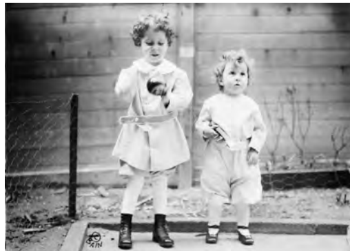
126 children were on board the Titanic. 60 of them died. These two little ones lived. The tiny tot on the right wouldn't remember the horrors of that night. Now, he would be 109 years old.