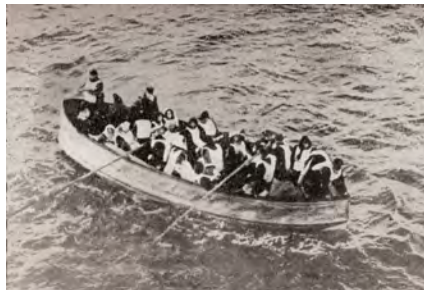
The bottom was 2.37 miles down, and the super cold salt water was about 29 degrees. So these dear people were so happy to be out of the water, and were grieving for those who were in it. The horrors they saw and heard that night put them in a kind of mental shock probably similar to the way God’s dear people will feel during the seven last plagues when “a thousand shall fall at thy side, and ten thousand at thy right hand.” Ps. 91:7.