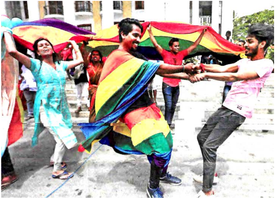
In the end of the world -

“The voice said, Cry. And he said, What shall I cry? All flesh is grass, and all the goodness thereof is as the flower of the field: The grass withereth, the flower fadeth: