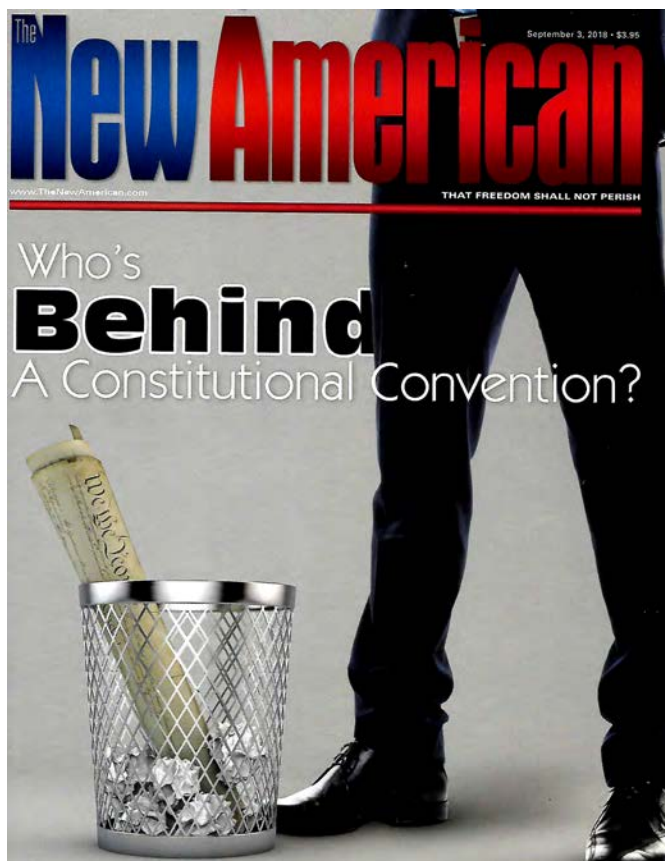
Do you see the Constitution in the trash can?

If they choose to live without dear Jesus - who fully paid the penalty of our sins, they’ll “have hell to pay.” They don’t know that even if they reject Him forever, He still loves them with an unconditional and undying love. That means that when they are burning to ashes and screaming in the fire of hell - suffering for every sin they’ve ever committed - God loves them just as much as He did when they were tiny babes in their mothers’ arms. In the fire of hell, God’s tender love for them has not changed. And their suffering will not last forever. It is limited to their own sins. Dear Jesus said, “He that sinneth against me wrongeth his own soul: all they that hate me love death.” Prov. 8:36. So after the eternal fire - which nothing can quench - burns the wicked to ashes, and the fire goes out {Isa. 47:14} they - by their own choice - cease to exist - forever. Bye bye.