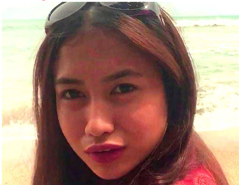
Here she is at the ocean posing for a video - not knowing that before she can count to five, she -

“And then shall appear the sign of the Son of man in heaven: and then shall all the tribes of the earth mourn, and they shall see the Son of man coming in the clouds of heaven with power and great glory. And he shall send his angels with a great sound of a trumpet, and they shall gather together his elect from the four winds, from one end of heaven to the other... Therefore be ye also ready: for in such an hour as ye think not the Son of man cometh.”