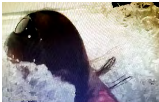
will be -