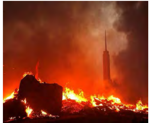
The Pentecostal church. Dear Jesus loves them all.

Hope: Praise God! Why do some good and bad people die in calamities, and others are saved by the power of God? Why did our kind Father permit the devil to bring the fire that killed all those people? Why didn't He save the SDA church building? And why didn't He save the homes of the