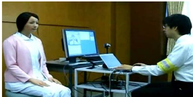
One is a human and the other is a robot. In this picture, she is not smiling.