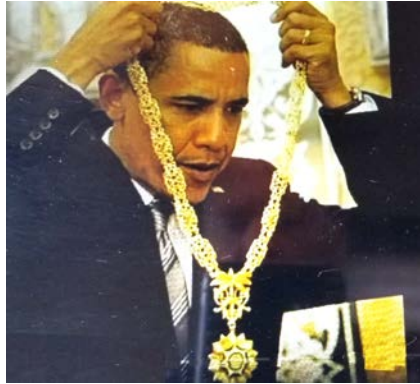
A high Prince Hall Mason

One night I was sucked up out of my bed and flown through space at an incredible speed to another planet where there was a great mansion. [They call it astral projection.] I