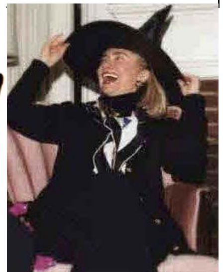
Witchcraft doesn’t bother her because Jesuit Georgetown University Bill Clinton revealed that his wife speaks with dead Elinor Roosevelt, to help her know what to do.