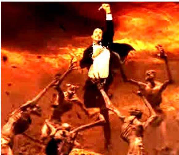
In the end of the world people try to escape from the evil angels that control the masses and the religious leaders. In this letter, you’ll get a hint of it - showing that dear Jesus will soon come in the clouds “with power and great glory.” Matt. 24:30.