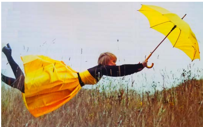
Magic in the last days. "Because they be replenished from the east, and are soothsayers like the Philistines, and they please themselves in the children of strangers." Isa. 2:6.

And I saw another sign in heaven, great and marvellous, seven angels having the seven last plagues; for in them is filled up the wrath of God. And I saw as it were a sea of glass mingled with fire: and them that had gotten the victory over the beast, and over his image, and over his mark, and over the number of his name, stand on the sea of glass, having the harps of God. And they sing the song of Moses the servant of God, and the song of the Lamb, saying, Great and marvellous are thy works, Lord God